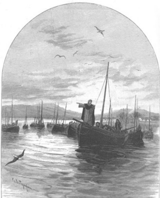
Blessing the Claddagh Fleet - from an 1888 sketch by Charles Whympers.

These talks are part of the club's participation in the Galway City Council Decade of Centenaries Programme. We are grateful for the City Council funding which has enabled us to host these talks and develop a photo exhibition highlighting the hooker boats, the skills of the boat builders and the heritage of the Claddagh community.